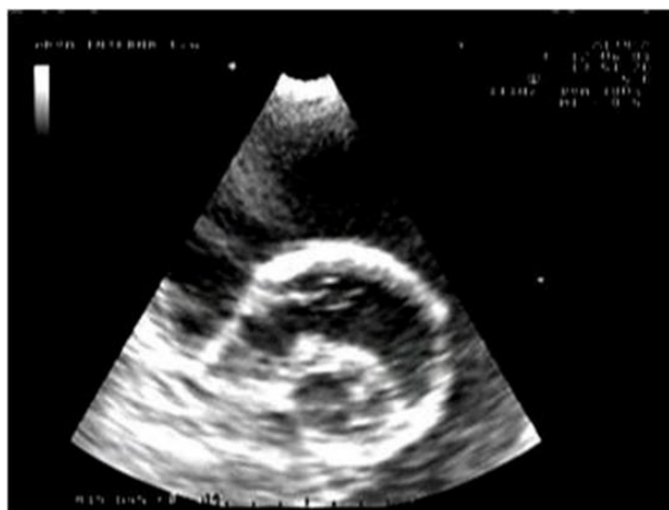
Fig. 2. Echocardiogram of a dog with strong hydro pericardium and clearly visible adult forms of Dirofilaria in the lumen of the right ventricle and pulmonary artery - Caval syndrome (Echo 0)

The examined electrocardiograms mainly revealed physiological values, while a small number of patients showed sinus rhythm tachycardia. A shift of the electrical axis to the right was observed in 41.17% of dogs (14/34). Of 10 dogs which had irregularities on the first echo examination, four expressed AV-block II degree, which constituted 71.42% of the total number of dogs with ECG changes detected, and two dogs had atrial fibrillations, which was 35.71% of the total number of dogs in which ECG changes were observed.