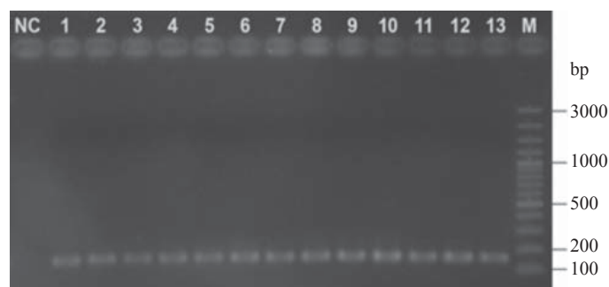
Fig. 1. Results of genotype-specific PCR analysis for Prototheca spp. mastitis isolates. NC: negative control; Lines 1-13: P. zopfii genotype 2 mastitis isolates; M: molecular weight marker.

In order to identify isolates of Prototheca spp. which were isolated in cases of bovine mastitis, three variable regions of the 18S rDNA genes were amplified by PCR. All 13 isolates were identified as P. zopfii genotype 2, since the amplicon (165 bp) specific for P. zopfii genotype 2 (Fig. 1) was observed. The PCR specific for P. zopfii genotype 1 was always negative, as was the PCR specific for P. blaschkeae .