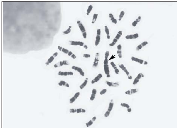
Figure 1. G-band of chromosomes of the mouse treated with the highest dose of fumagillin (75 mg/kg b.w.) – arrow indicates the Robertsonian chromosome Rb (4.19)