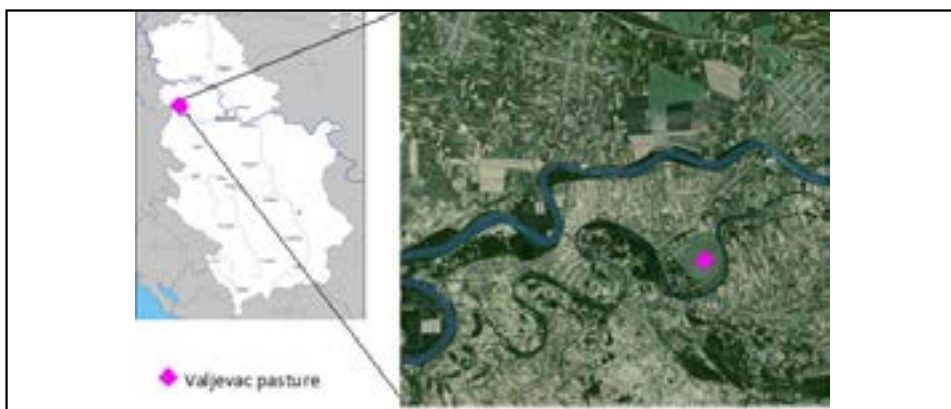
Figure 1. Location of the sampling site – Valjevac pasture