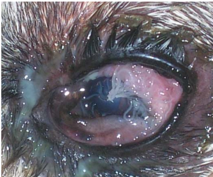
Figure 2. Eye of an infected dog with numerous adults of T. callipaeda