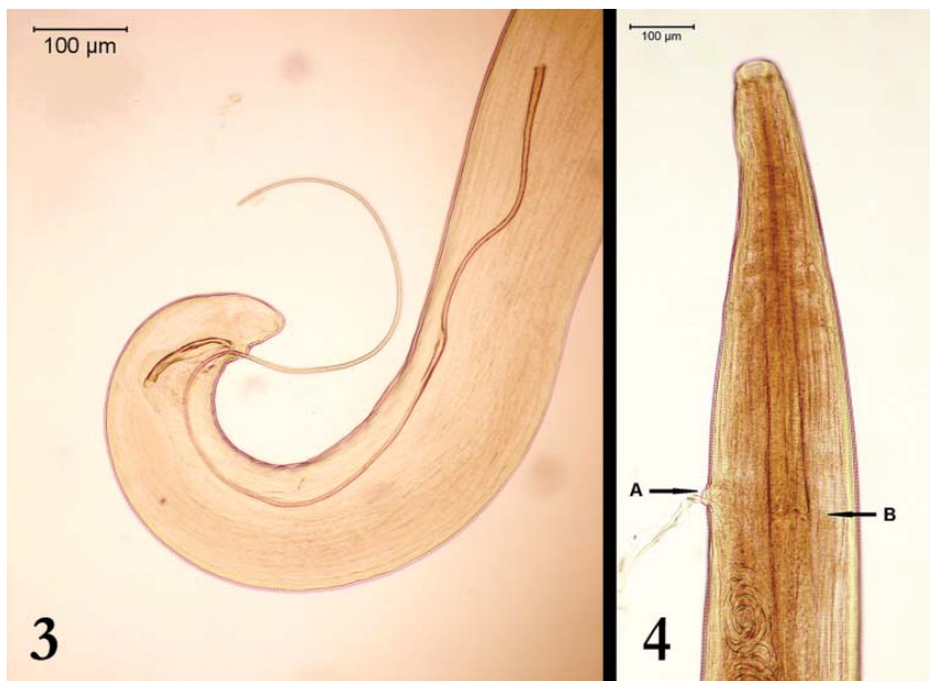
Figure 3. Posterior end of T. callipaeda male with unequal spicules; Figure 4. Anterior end of T. callipaeda female with vulva (A) and oesophago-intestinal junction (B)

* m-male; f-female; ** Yugoslavian shepherd dog-Sharplanina