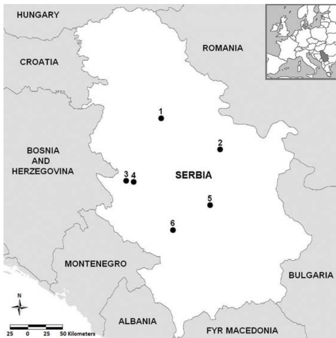
Figure 1. Location of cases of T. callipaeda infections reported in Serbia

Adult parasites were collected in 2012 and 2013 from the eyes of four dogs and two cats originating from six different sites in Serbia (Figure 1, Table 1). All animals were