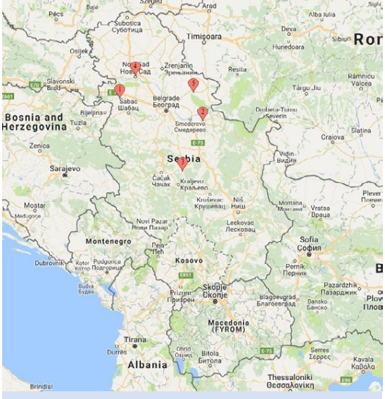
Figure 1: Location of the 5 different areas of Serbia where grazing cows were sampled for Mycoplasma bovis serology: 1 -Zasavica, 2 - Pozarevac, 3 - Gruza, 4 - Novi Sad and 5 - Banatski Karlovac (MapCustomizer, <a href="https://www.mapcustomizer.com/">https://www.mapcustomizer.com/</a>).