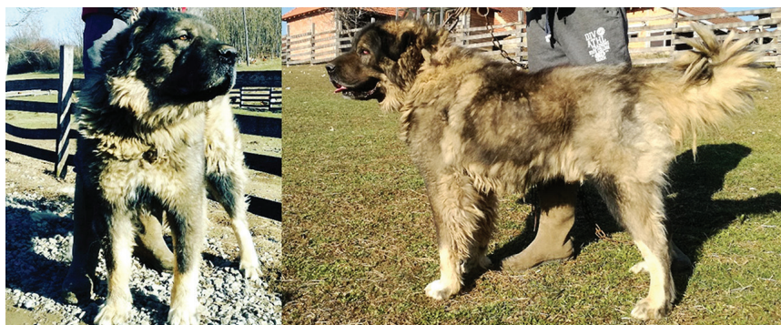
Figure 1. Yugoslavian Shepherd Dog – Sharplanina

As explained by Dimitrijevic [27], samples (buccal swabs) were taken in 2006 and 2007 from dogs that fit breed standards at dog shows specialized for the YSD breed (Smederevska Palanka, Serbia, 8 th April 2006, and Velika Plana dog show, Serbia, 14 th April 2007), at an international dog show (41. C.A.C.I.B. show, Belgrade, Serbia, 11 th March, 2007) and from a military centre for dog training (sampled in May 2007) (Figure 1, Table 1). Procedures for the extraction of the genomic DNA, PCR amplification of microsatellite loci, separation of PCR products and allele scoring are given in Dimitrijevic [27] and Dimitrijevic et al. [28].