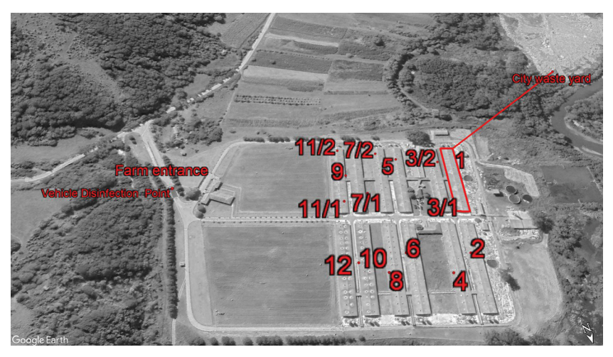
Figure 1. Geospatial farm setup Legend: No.1, 9 – gestating stable; No. 3/2, 7/2, 11/2 – farrowing room; No.5 – insemination stable; No. 3/1, 7/1, 11/1 – weaning stable; No. 2,4,6,8,10,12 – fattening stable