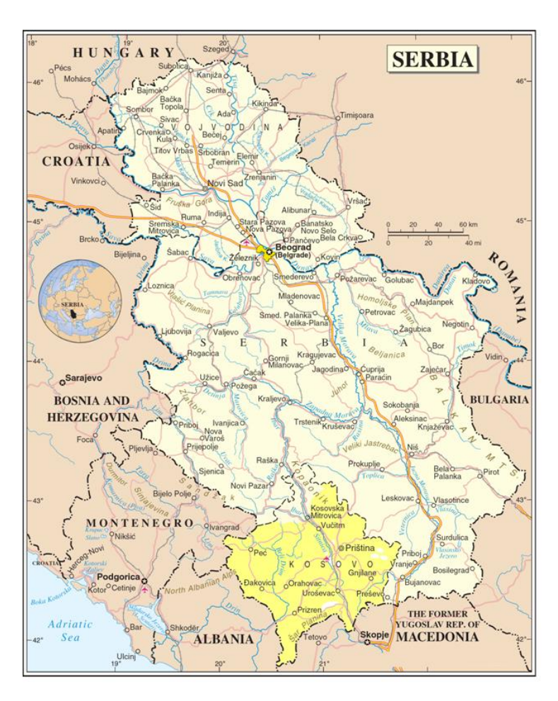
Fig. 1: Map of sampling area - Encircled part of the map

(42°43'00"N 24°55'04"E). This is the highest mountain in South-East Serbia. Stara Planina (Balkan mountain) is the Southern Karpathian fold stretching for 560 km from Vlashka Chuka Peak fist to the North on the border between Serbia and Bulgaria and then folding East through Central Bulgaria to Cape Emine on the Black Sea, thus framing the Pannonian Basin on the South of the Danube (Fig. 1). Stara Planina has a characteristic climate changing from moderate continental, mountain (Alpine) and on the high peaks subarctic. Going from low to higher slopes, the average temperature drops while humidity increases. With an average temperature of 0.5 °C, the coldest month is Jan, while July with 22 °C is the warmest. Average annual rainfall is 960.5 mm.