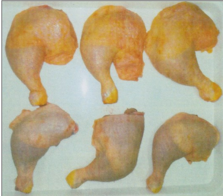
Figure 2. Drumstick plus thighs of broilers fed with designed feed, with the addition of extruded flaxseed (above), and broilers fed with conventional feed (below)

The carcass fatty acid profile directly reflects the fatty acid profile in the animal's diet [4]. Since flaxseed has a desirable fatty acid composition, many producers are interested in using it in the final fattening of pigs and poultry, to improve the fatty acid composition of adipose tissue and pig meat. In the diet of pigs, soybean and sunflower are used, as well as other oilseeds that contain fatty acids from the n-3 series and fatty acids from the n-6 series [12].