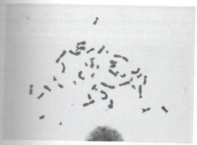
Figure 1. Giemsa-stained human metaphase chromosomes isolated from a culture treated with 10 µg/ml of cloprosteno

The results of the in vitro cytogenetic test are shown in Table 1. The level... aberrations for experimental concentrations of cloprosteno... 2.00% to 3.47% and those changes were not statistically significant in... to the value of the negative control (2.00%). Metaphase... isolated from cultures treated with 10 µg/ml of cloprosteno... Figure 1. Only treatment with the positive control (10 -6 M MNNG) caused