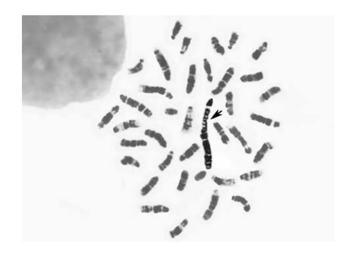
Figure 1. G-band karyotype of a BALB/c mouse treated with fumagillin (20 mg/kg bw) with one large chromosome

Fumagillin has been frequently used for the suppressing of Nosema apis infections in honey bees (Katznelson and Jamieson, 1952; Bailey, 1953). In addition, in humans it has been recommended for curing microsporidial eve infections (Roseger et al., 1993, Willkins et al., 1994) and in the treatment of chronic Enterocytozoon bieneusi infections common in HIV patients (Molina et al., 2000, 2002; Conteas et al., 2000). Due to high stability in bees' food (Assil and Sporns, 1991) its residua in honey or other bee products can easily reach final users (Stanimirović et al., 1999, 2005, 2006, 2007; Stevanović et al., 2000, 2006, 2008; Kulić 2006). Furthermore, the data on its genotoxic effects in vitro are contradictory: while the results of one group of authors are positive (Stoltz et al., 1970;