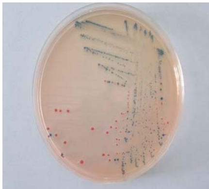
Figure 2. Red color on (RajHans Medium) means Salmonella findings

on the presence of Campylobacter jejuni . Cloacal swabs were placed in tubes with peptone water, while the liver, spleen and intestine were placed in Erlenmeyer dishes with 50 mL of peptone water. Peptone water was incubated at 37°C for 24 hours for pre-enrichment purposes. One milliliter of peptone water was transferred to semisolid media Rappaport Vassiliadis (HiMedia) according to the recommendation of Quinn et al. (2002).