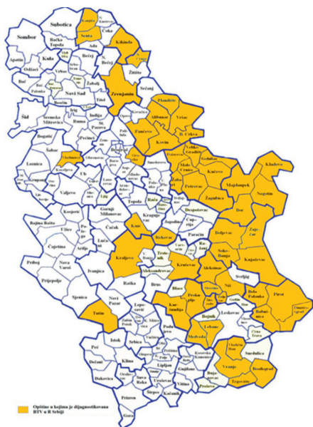
Figure 1. Distribution map of bluetongue cases in territories covered by veterinary institutes in Serbia in 2014

of BTV virus serotype 4 in 56.78% of seropositive samples. With regards to the total number of susceptible animals (1 484 725) kept in the areas of BTV outbreak recorded in 2014, the overall incidence proportion of BTV in Serbia reaches 0.16% (2 313 infected animals).