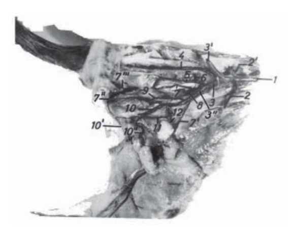
Figure 2. Topographical position of the common iliac artery and its branches 1- aorta abdominalis, 2- a. circumflexa ilium profunda sinistra, 2'- a.circumflexa ilium profunda dextra, 3- a. iliaca communis sinistra, 3'- a. iliaca communis dextra, 3"- a. iliaca externa sinistra, 4- a sacralis media, 5- a. iliaca interna, 6- a. glutea cranialis, 7- a. pudenda interna, 7'- a. umbilicalis, 7"- a. dorsalis penis caudalis, 7"'- a. rectalis caudalis, 8- a. circumflexa femoris lateralis, 9- a. obturatoria, 10- a. pudenda externa, 10'- a. dorsalis penis cranialis, 10"- branch for In. inguinalis superficialis, 11- a. epigastrica caudalis, 12- a. vesicalis caudalis

The external iliac arteries (a. iliaca externa dextra et a. iliaca externa sinistra, Figure 1_2 ', 1_2 '', 2_3 '') are stronger branches of the common iliac arteries in the