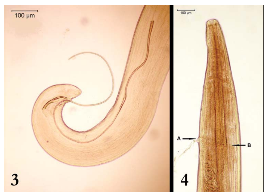
Figure 3. Posterior end of T. callipaeda male with unequal spicules; Figure 4. Anterior end of T. callipaeda female with vulva (A) and oesophago-intestinal junction (B)

* m-male; f-female; ** Yugoslavian shepherd dog-Sharplanina