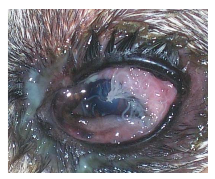
Figure 2. Eye of an infected dog with numerous adults of T. callipaeda