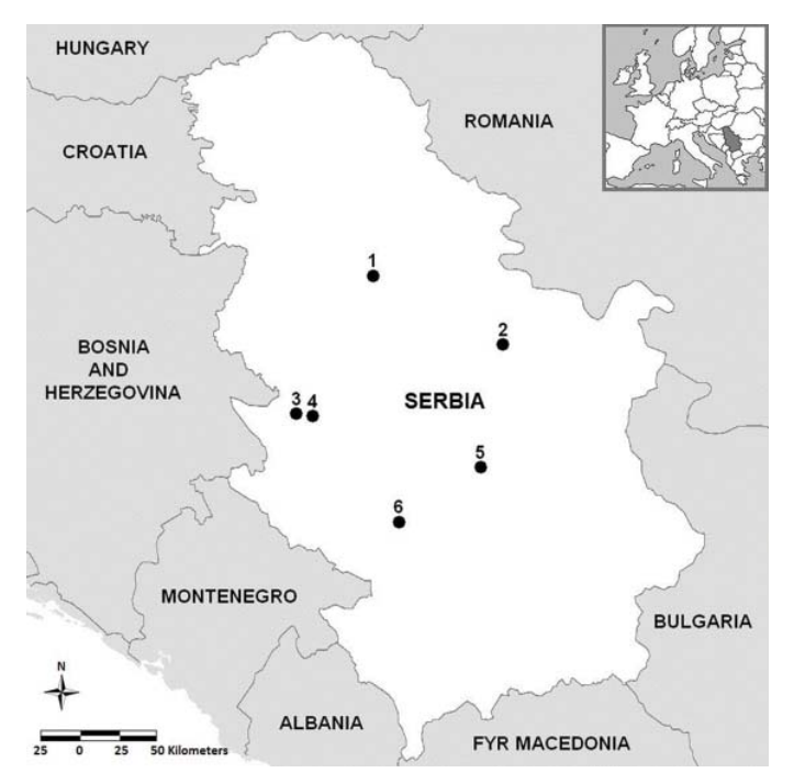
Figure 1. Location of cases of T. callipaeda infections reported in Serbia

Adult parasites were collected in 2012 and 2013 from the eyes of four dogs and two cats originating from six different sites in Serbia (Figure 1, Table 1). All animals were