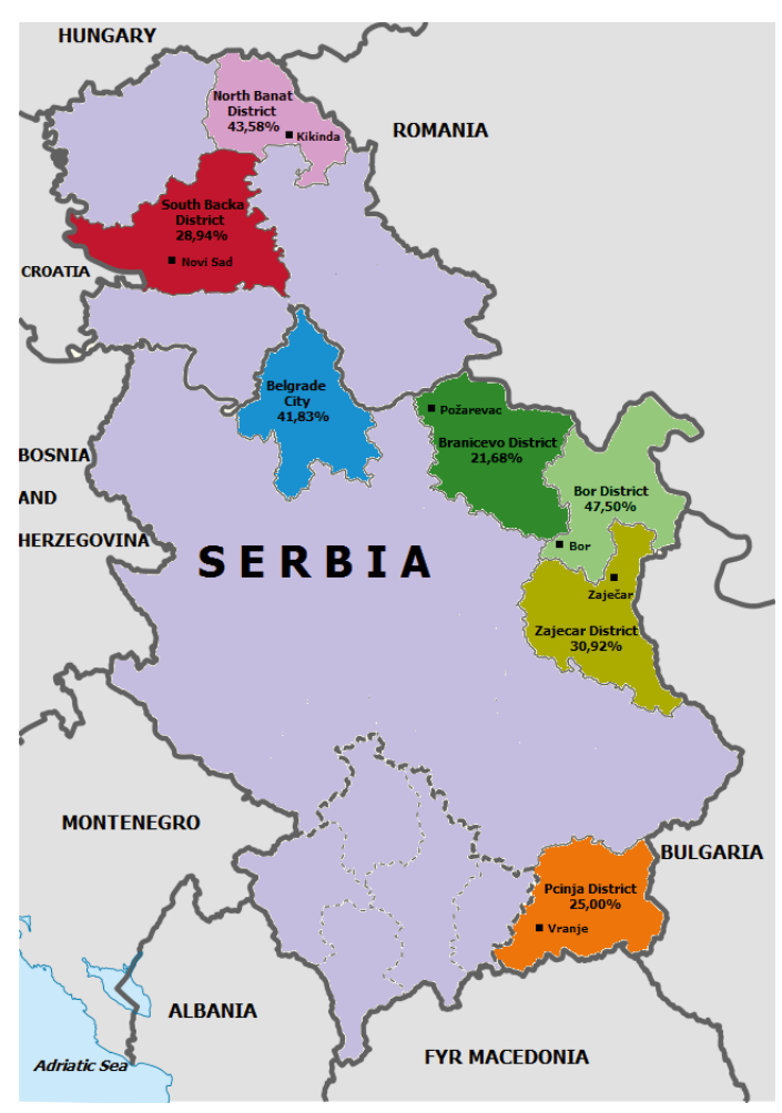
Fig. 1. The distribution of Thelazia callipaeda in Serbia

The research was performed on dogs in the Republic of Serbia from the end of April 2013 to the end of October 2015. In this period, thelaziosis was diagnosed in 178 out of 501 privately owned dogs with manifested ocular disorders. Of all positive dogs, 39 were from northern Serbia (North Banat District and Novi Sad suburbs, i.e. south Bačka District), 59 were from central Serbia (Belgrade suburbs and Braničevo District), and 68 were from eastern Serbia (Bor and Zaječar districts), and 12 from southern Serbia (Pčinja District) (Fig. 1). Infected dogs were of different breeds (mixed breeds, German Shepherd, Airedale Terrier, German Jagdterrier, Weimaraner, German Shorthaired Pointer, Samoyed, and other) and of both sexes. Their age ranged from 10 months to 13 years, they lived outdoors, and some were used for hunting. All animals were in good body condition, but were referred to the practice because of ocular discharge. The total prevalence of ocular manifestations amounted to 35.52% (178/501). The prevalence of mild ocular manifestacions (ocular discharge, follicular conjunctivitis and blepharospasm) was 32.53% (163/501),