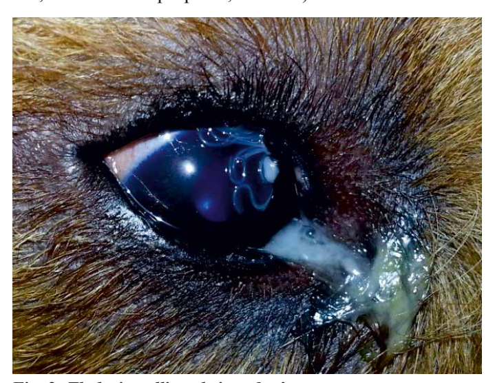
Fig. 2. Thelazia callipaeda in a dog's eye

Adult parasites were removed mechanically with microsurgical instruments (suture-tying forceps without teeth) after eversion of the third eyelid. Depending on the number of parasites present and the patient's aggressiveness, the removal was performed under local anesthesia (bupivacain, tetracain), mild sedation (ketamin hydrochloride, diazepam) with local anesthesia or under general anesthesia (cevofluran, induced with propofol; ketamin). After the removal of