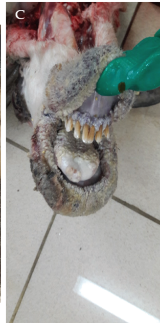
Figure 3. a) Salivation, hyperemia and ulceration of nostrils in sheep; b) Proliferative and advanced changes in affected sheep; c) Advanced changes in oral cavity, lips and skin