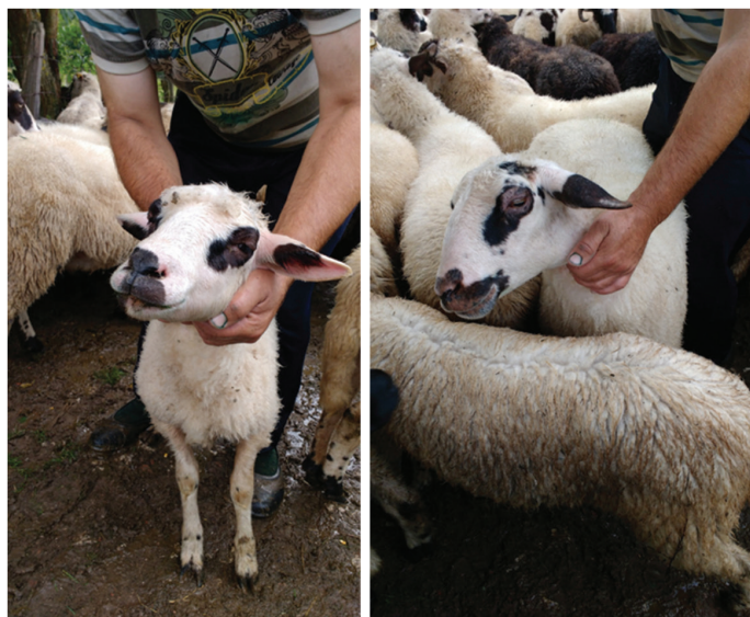
Figure 1. Initial clinical picture in the flock: swelling of ears, lips and eyelids

Clinical examination. A number of animals, including sheep and cattle, were not adequately marked on the farm, meaning animals did not have ear tags or other identification marks. In order to conduct proper sampling, triage of animals was applied, i.e. sampling and clinical examination was carried out only in 32 sheep and 7 cattle with valid marking (ear tags). Sheep in the suspected flock had poor health status. It was clearly noticeable that the sick sheep were apathetic and depressed. On careful physical examination of affected animals, it was noted that several types of clinical changes, depending on the course of the disease, existed in the flock. Clinical changes were more noticeable in lambs. Fever, general weakness, and edema of ears, eyelids and lips were observed as initial clinical changes in lambs (Figure 1). These lambs expressed various degrees of respiratory distress.