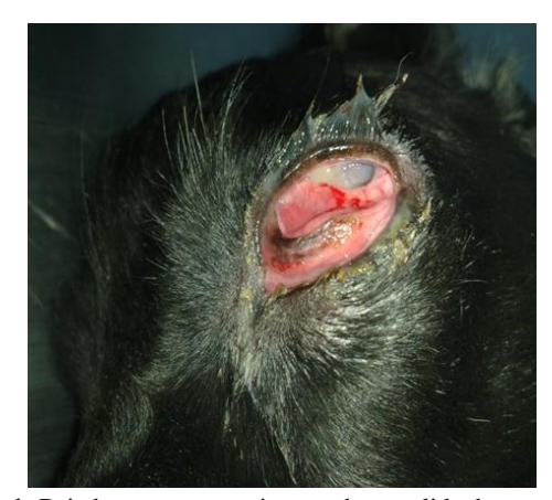
Fig. 1. Dried mucous secretion on the eye lids, hyperaemia, oedema of the conjunctiva with protrusion of the third eye lid and keratitis (one month after the first examination).

The inspection revealed changes on the auxiliary parts of the left eye and presence of dried mucus discharge. Alopecia was not noticed on the lids of the left eye. The third eyelid protruded out of its place covering half of the eye bulb (Fig. 1).