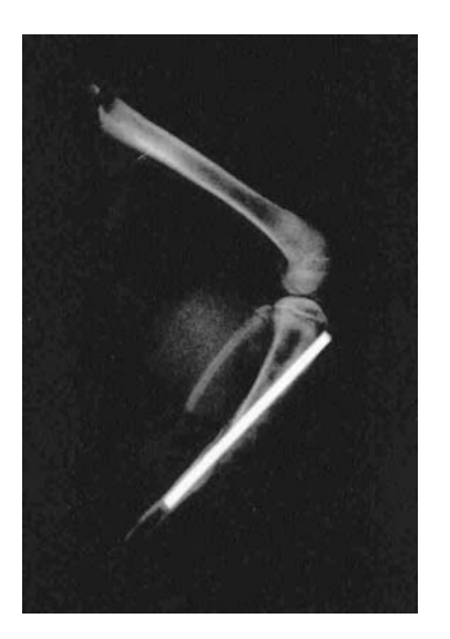
Figure 2. Radiography of an operated tibia from group A, on day 66, showing sanation at the fracture site

Radiographic examination confirmed that the Kirschner wire was in place in the operated animals from groups A, B and C (Figure 2). The degree of bone union at the fracture site was the most prominent in group A, and somewhat delayed healing was noted in group C (not